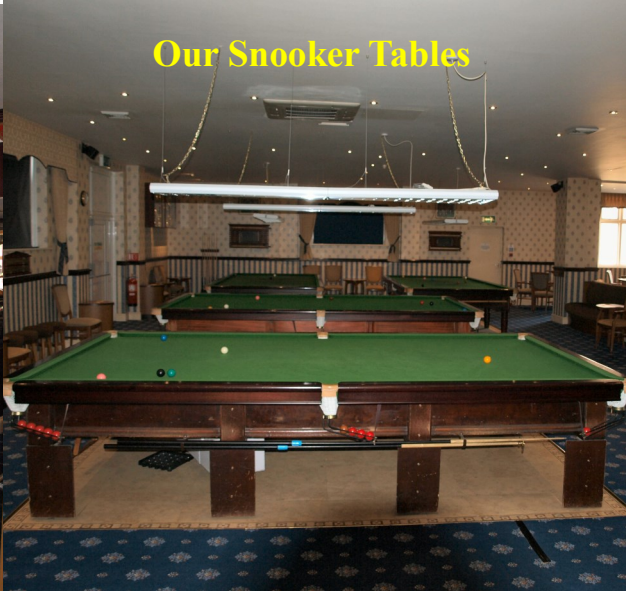
Our Snooker Tables