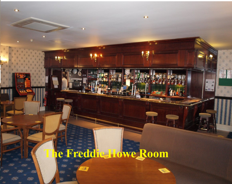
The Freddie Howe Room