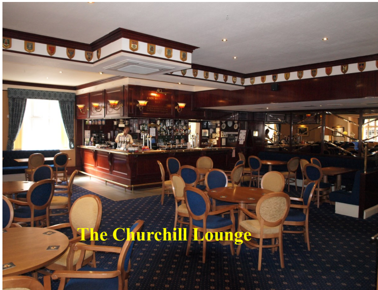
The Churchill Lounge

24 Station Road, New Milton, Hampshire BH25 6JX www.newmiltonconclub.co.uk